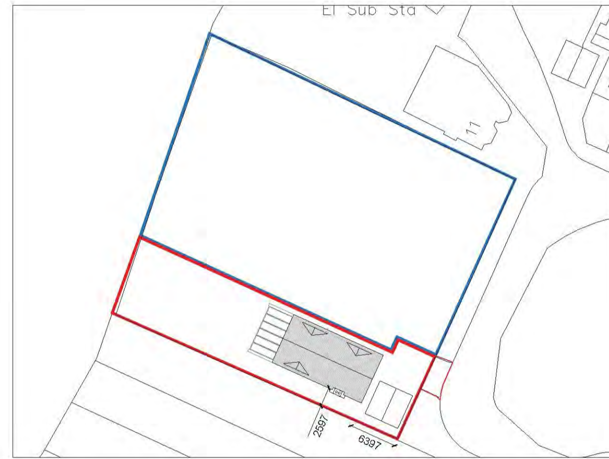
PROPOSED BLOCK PLAN - 1:500 0 10 20 30 40 50