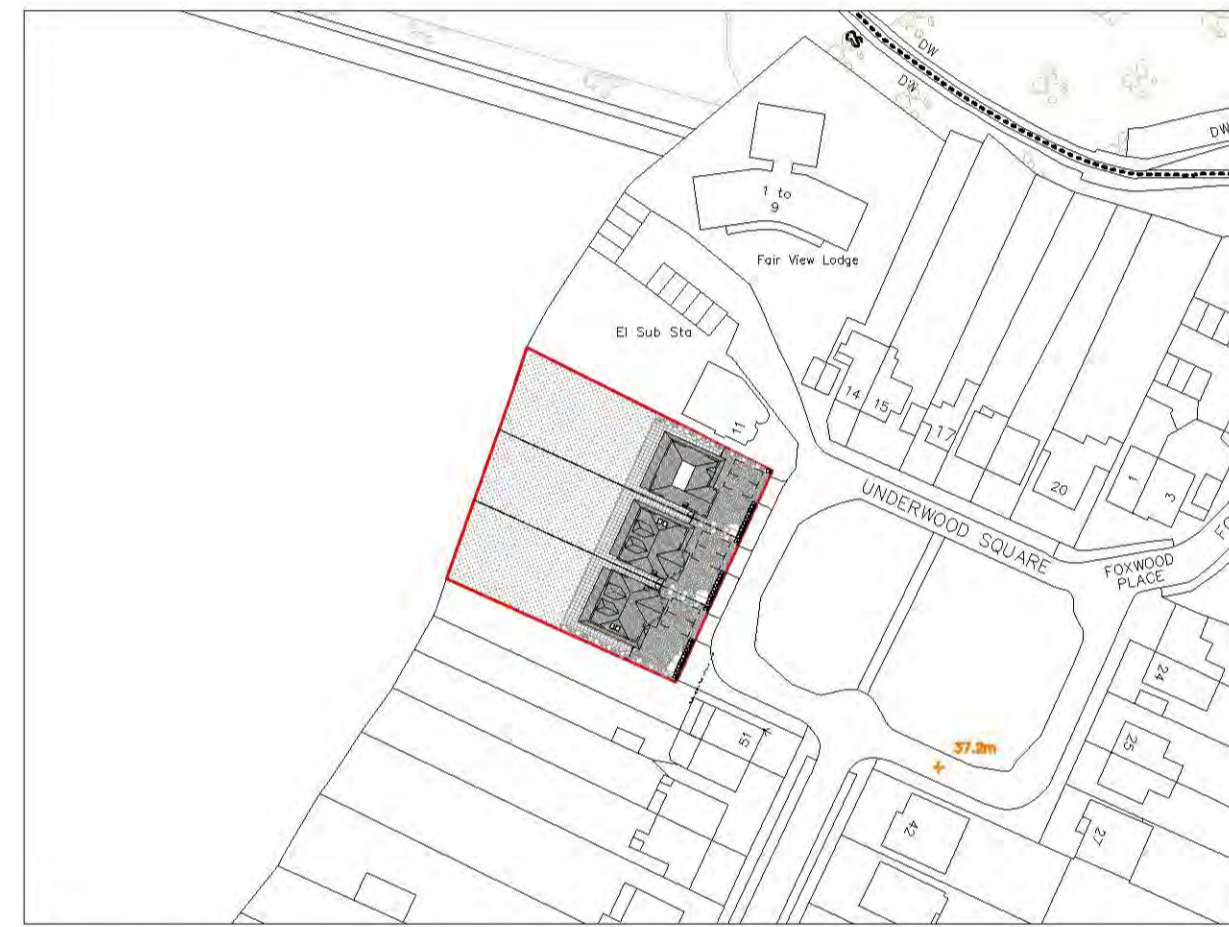
CURRENT CONSENT - LOCATION PLAN - 1:1250 0 25 50 75 100 125