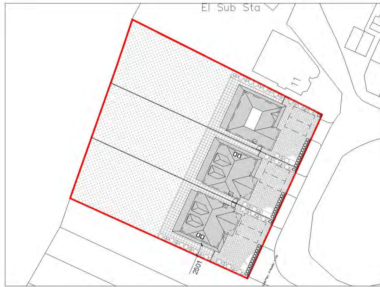
CURRENT CONSENT - BLOCK PLAN - 1:500 0 10 20 30 40 50