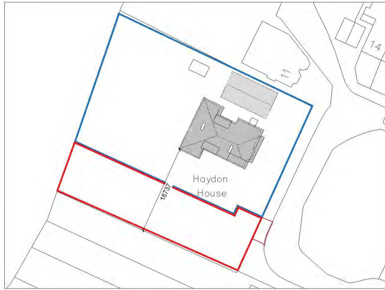
PRE-EXISTING BLOCK PLAN - 1:500 0 10 20 30 40 50