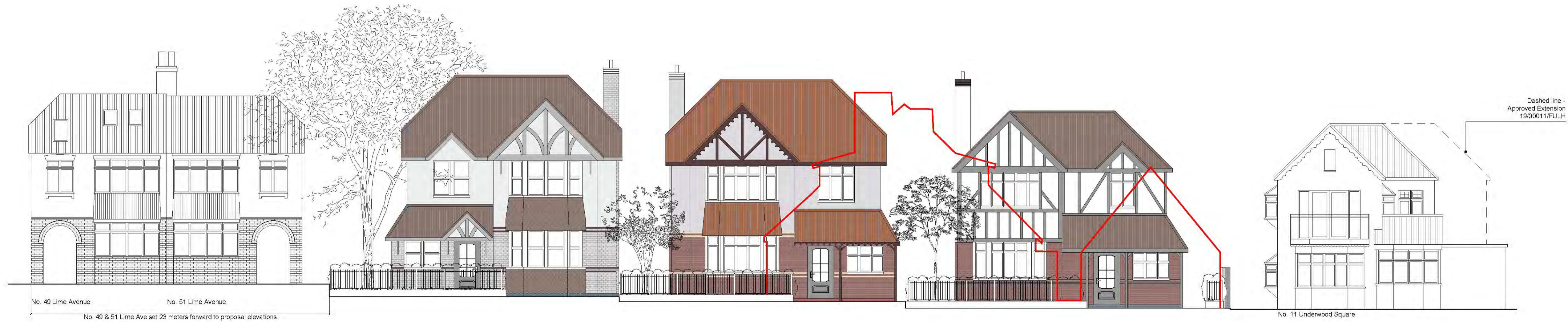
CURRENT CONSENT - STREETSCENE - 1:100 0 1 2 3 4 5

CURRENT CONSENT PLANNING REFERENCE: 18/01063/FUL DATED 3RD OCTOBER 2018