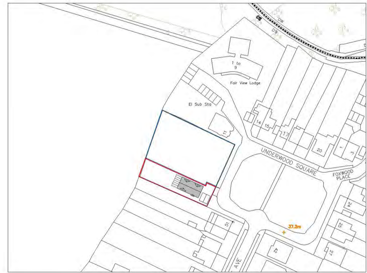
PROPOSED SITE PLAN - 1:1250 0 25 50 75 100 125