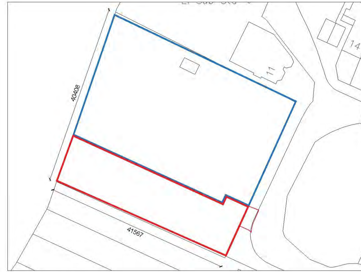
EXISTING BLOCK PLAN - 1:500 0 10 20 30 40 50